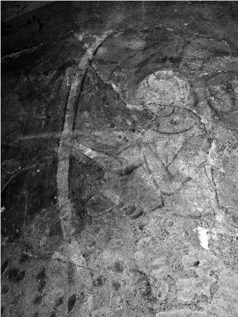
A unique painting of a left-handed archer, the only in the world, discovered at castle Houska in the Czech Republic