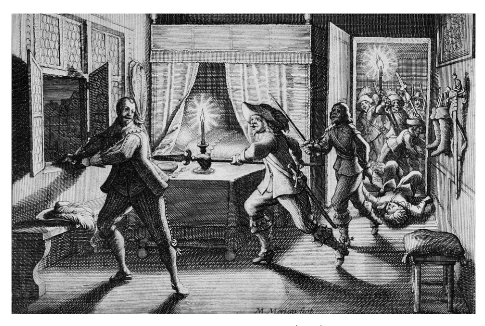
Fig. 1 The assassination of Albrecht of Valdštejn in Cheb (Eger). Engraving by Matthäus Merian, 1639 (SK).